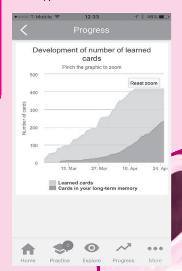
Figure 4. Progress status

to mention, giving feedback to learners is an important feature of many credible MALL apps.