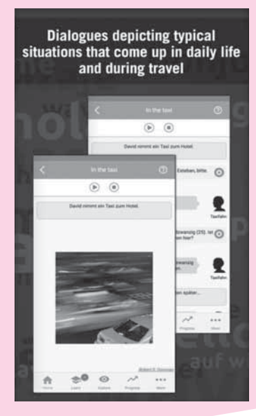
Figure 3. Bonus materials and audio conversations